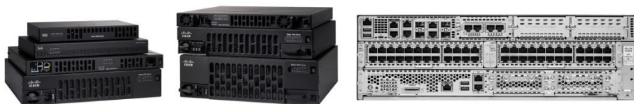
Figure 1. Cisco 4000 Series Integrated Services Routers

The Cisco 4000 Family contains the following platforms: the 4461, 4451, 4431, 4351, 4331, 4321 and 4221 ISRs.